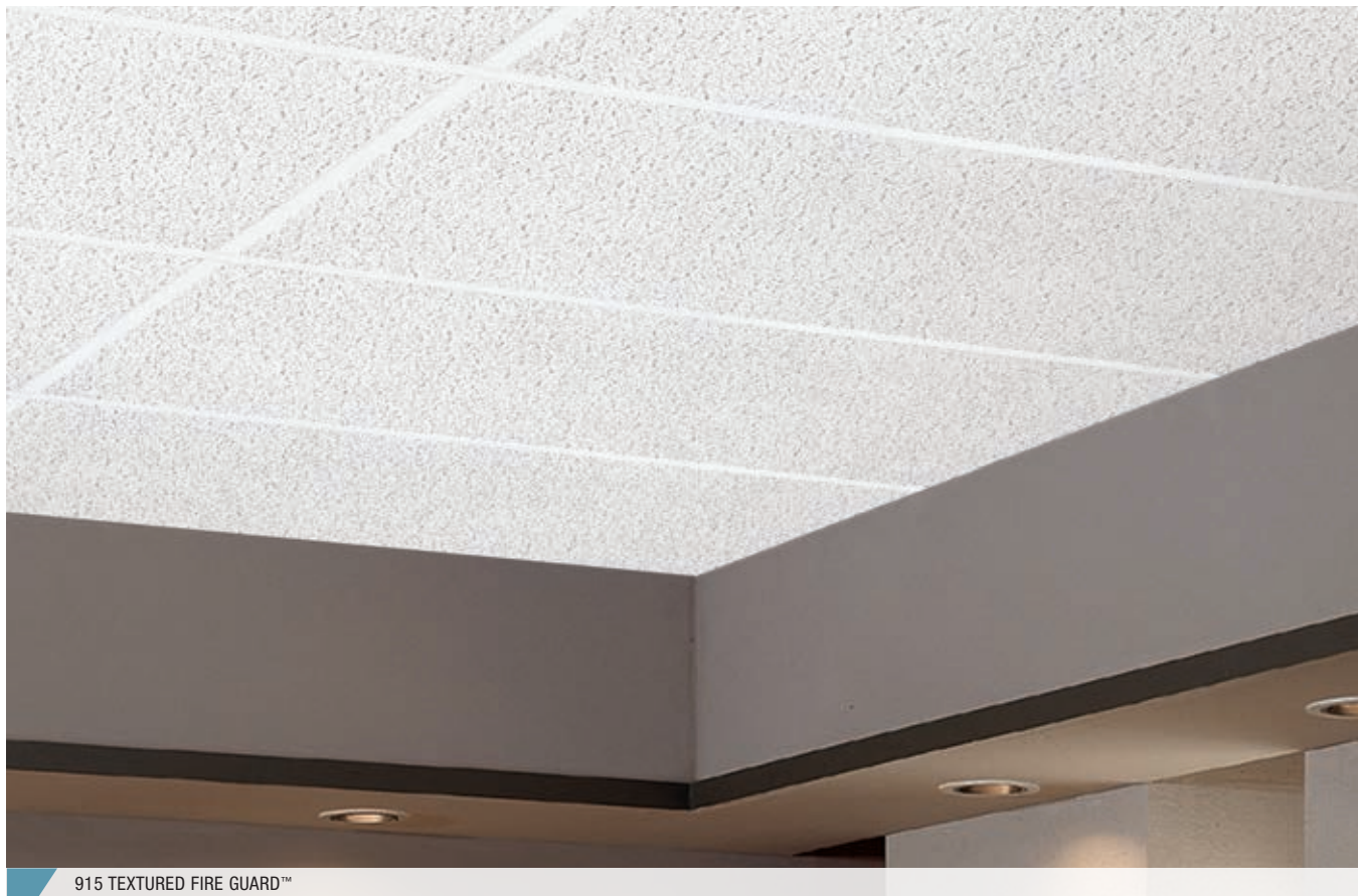
915 TEXTURED FIRE GUARD™

Textured FIRE GUARD™ ceiling panels provide a fire-resistant barrier when used in acceptable UL assemblies. Panels are available in a 24-in x 48-in square style.