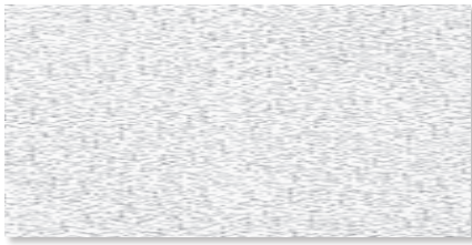
915 Textured FIRE GUARD™