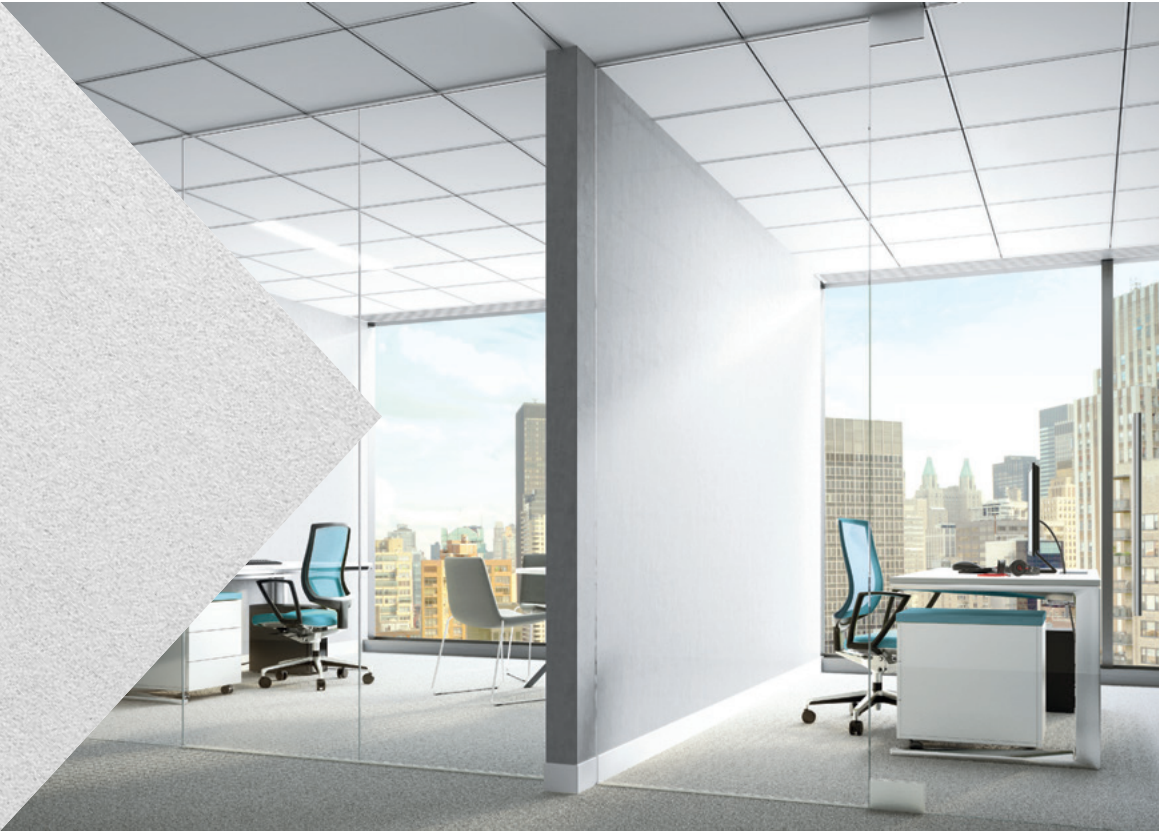
▲ Calla® PrivAssure™ Square Tegular panels with Suprafine® 9/16" suspension system

CAD/Revit® drawings at: armstrongceilings.com/cadrevit