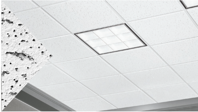
▲ Fissured™ Angled Tegular panels with Prelude® XL® 15/16" suspension system

Economical panels; Directional with standard acoustical performance.