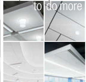
▲ Optima® PB Vector® panels with Prelude® XL® 15/16" suspension system

armstrongceilings.com/capabilities See more photos at: armstrongceilings.com/photogallery