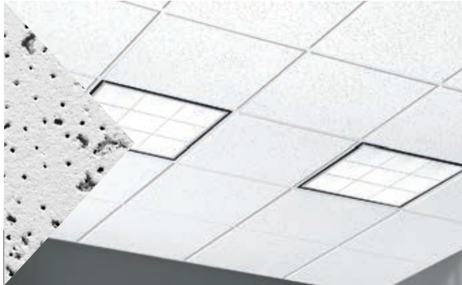
▲ Cortega® Angled Tegular panels with Prelude® XL® 15/16" suspension system

Medium-texture panels; Economical option with standard acoustical performance.