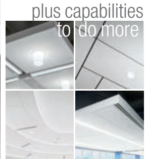
▲ Optima® Tegular 24" x 24" panels with Suprafine® 9/16" suspension system

armstrongceilings.com/capabilities See more photos at: armstrongceilings.com/photogallery