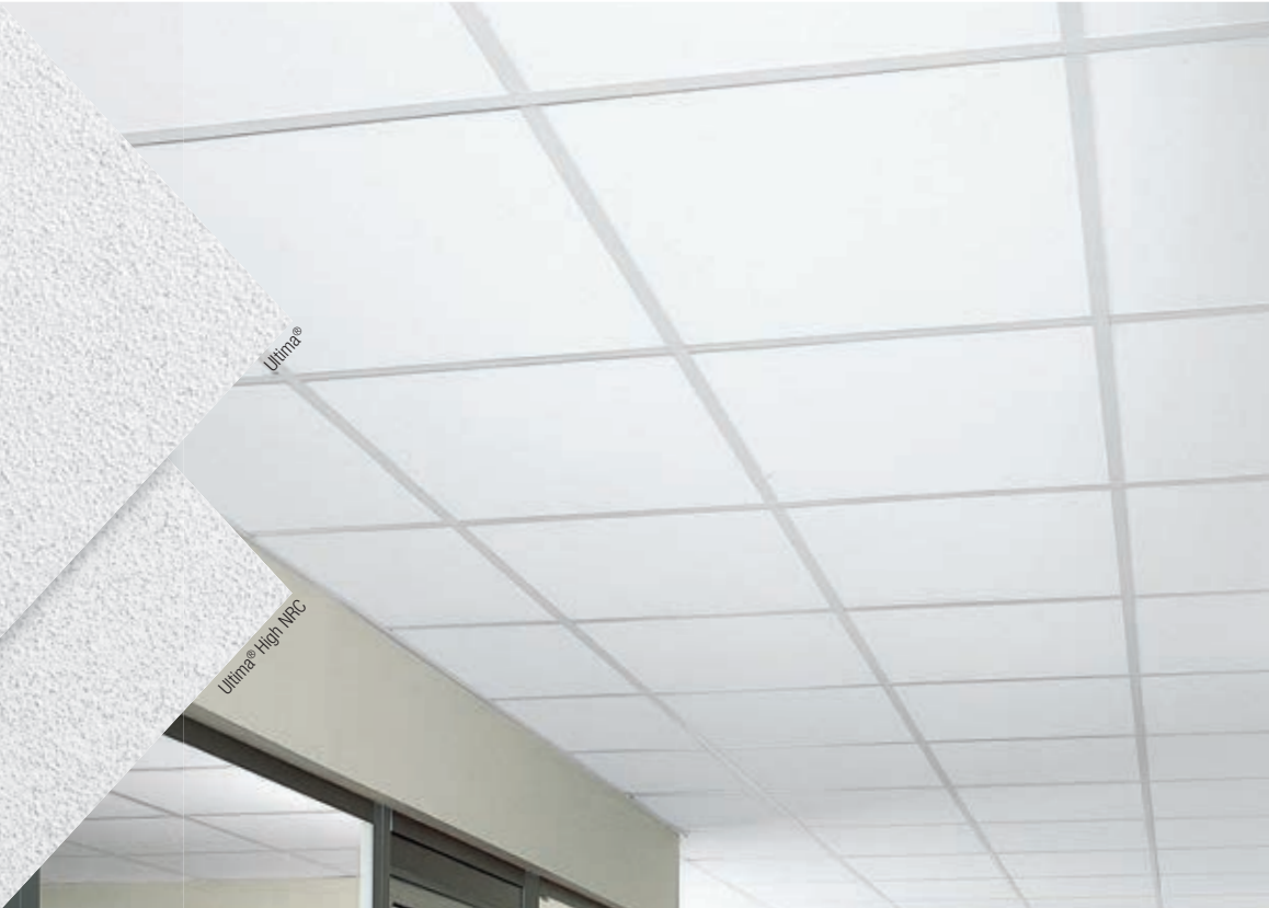
▲ Ultima® Square Lay-in panels with Prelude® XL® 15/16" suspension system

CAD/Revit® drawings at: armstrongceilings.com/cadrevit