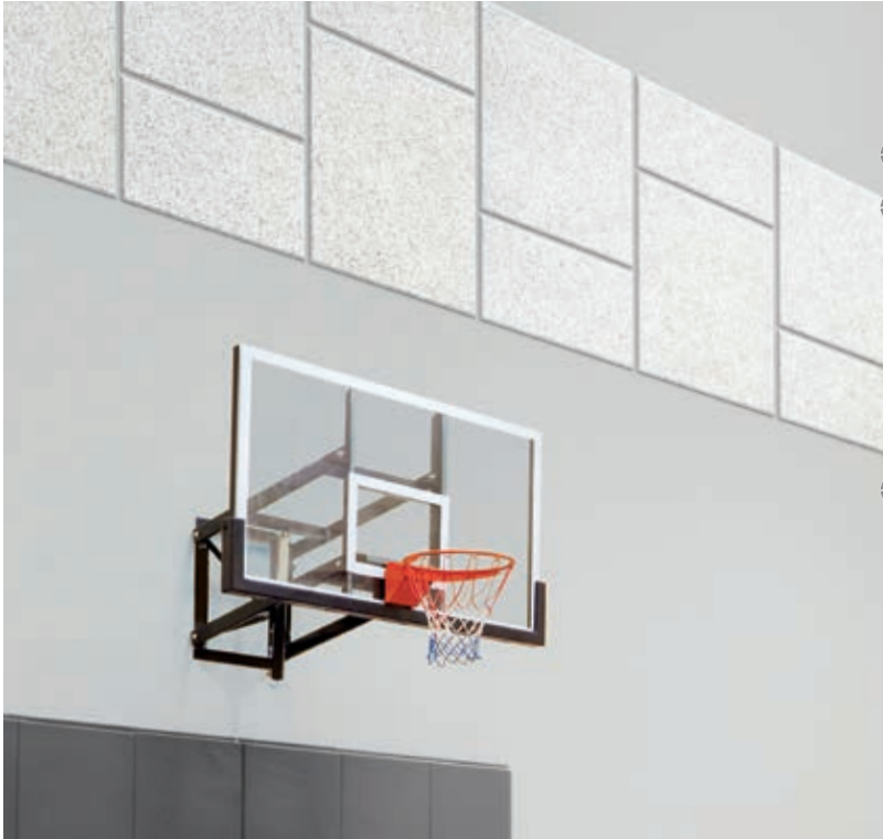
▲ Tectum® Finale™ Wall Panels (also available for ceiling applications)

For LEED contribution visit armstrongceilings.com/greengenie