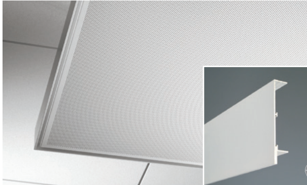
▲ Axiom® Vector trim

This trim coordinates perfectly with Armstrong® Vector ceiling panels to mimic the 1/4" reveal with a narrow vertical fin profile.