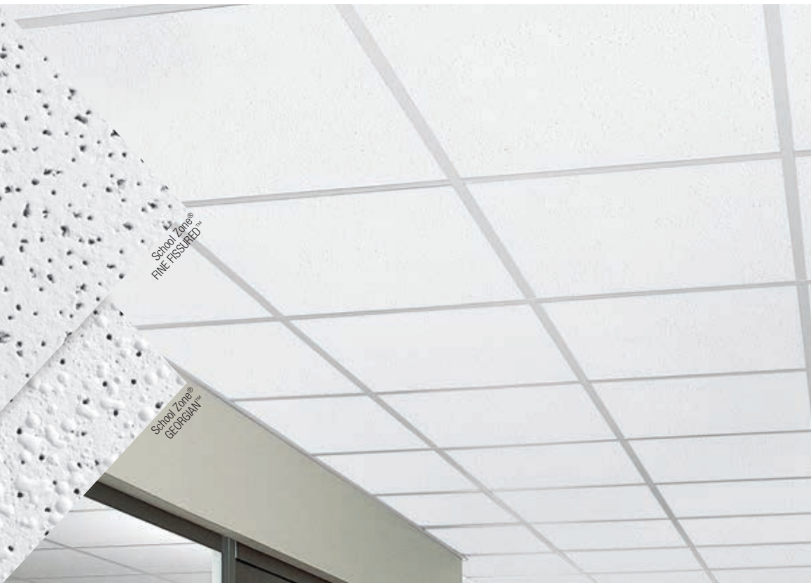
▲ School Zone® Fine Fissured™ panels with Prelude® XL® 15/16" suspension system

CAD/Revit® drawings at: armstrongceilings.com/cadrevit