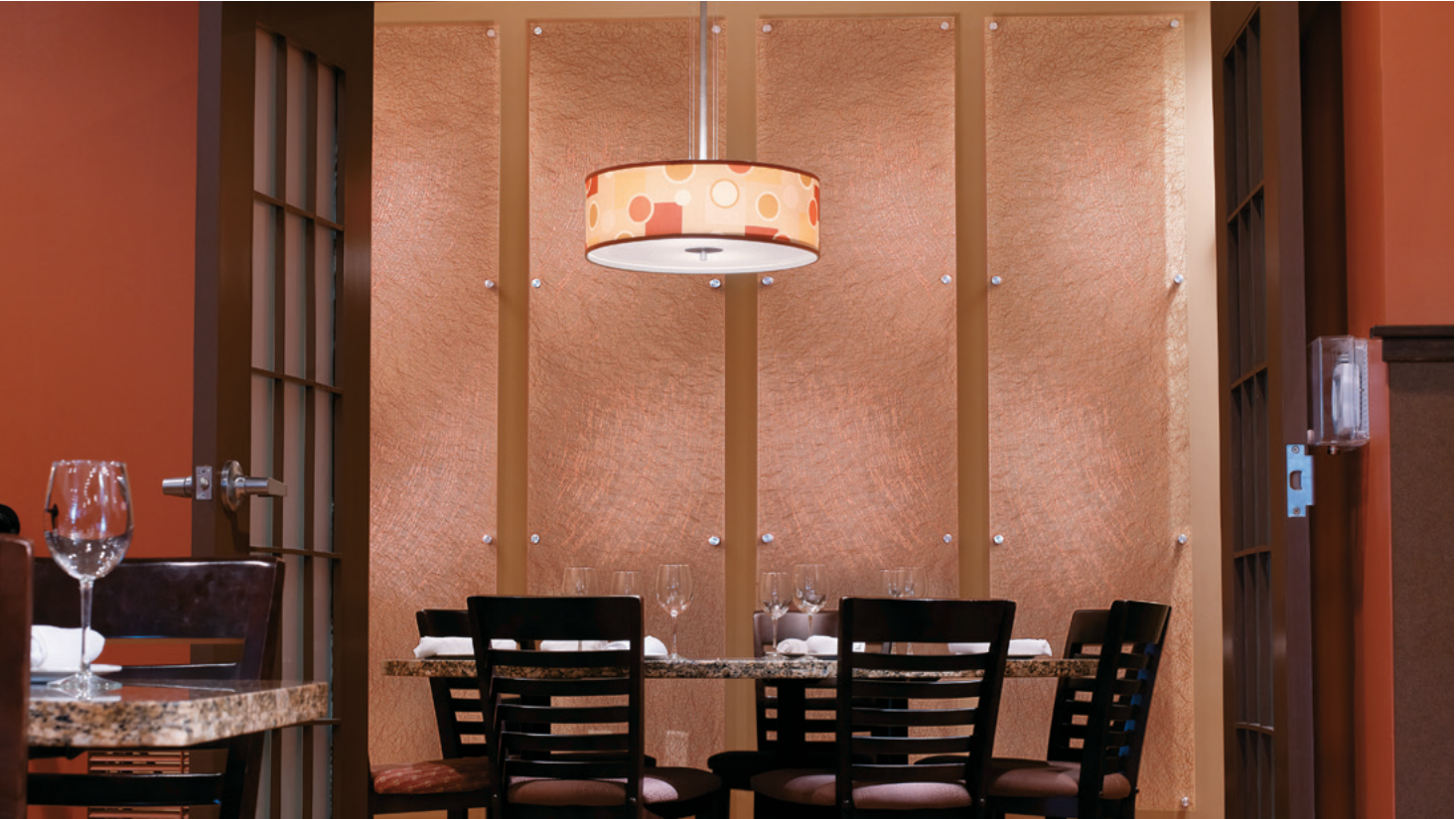
▲ Infusions™ Walls 24" x 96" in Spun Copper

Wall System available in translucent colors and patterns that can be hung individually or in a group.