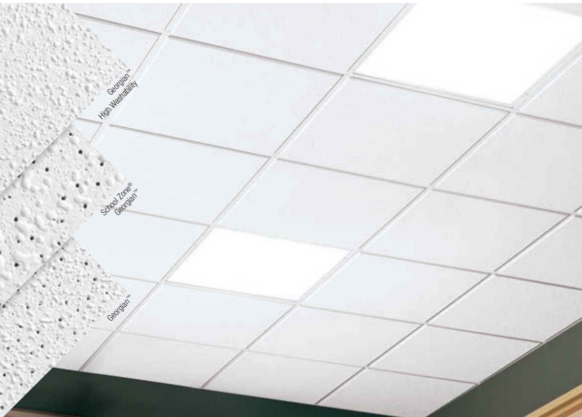
▲ Georgian™ Beveled Tegular panels with Prelude® XL® 15/16" suspension system

CAD/Revit® drawings at: armstrongceilings.com/cadrevit