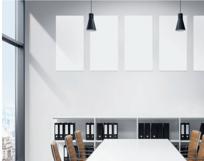
▲ InvisAcoustics™ 24" x 48" panels

Smooth-textured, hidden acoustical solution that installs directly to walls using ceiling adhesive.