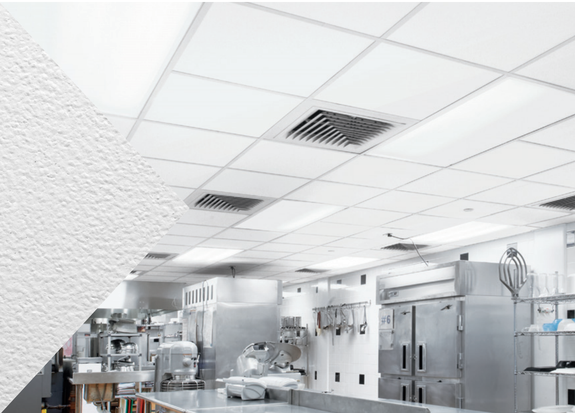
▲ Kitchen Zone™ 24" x 24" panels with Prelude® XL® 15/16" suspension system

CAD/Revit® drawings at: armstrongceilings.com/cadrevit