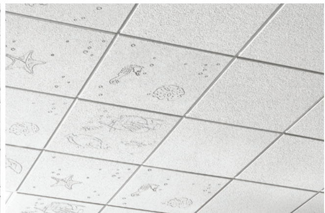
▲ Cirrus® Themes™ Under The Sea™ panels with Suprafine® XL® 9/16" suspension system