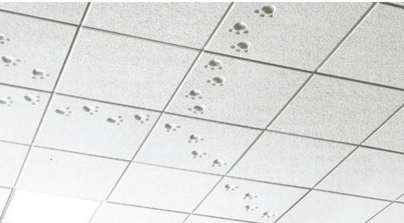
▲ Cirrus® Themes™ Critters™ panels with Suprafine® XL® 9/16" suspension system

Medium texture panels with playful designs for a fun addition to your projects.