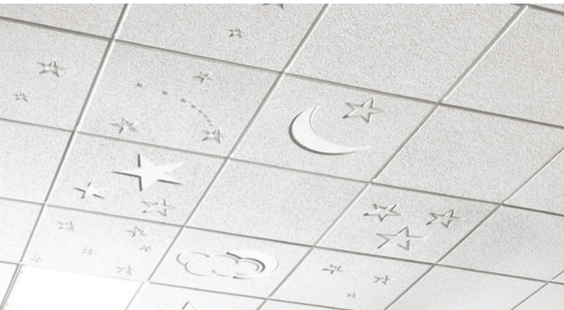
▲ Cirrus® Themes™ Stars™ panels with Suprafine® XL® 9/16" suspension system