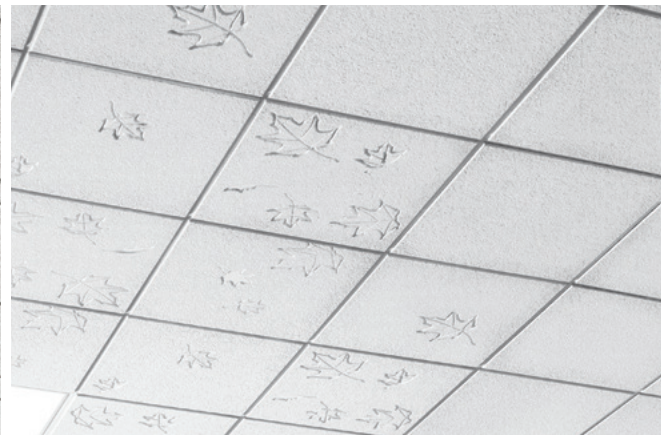
▲ Cirrus® Themes™ Leaves™ panels with Suprafine® XL® 9/16" suspension system