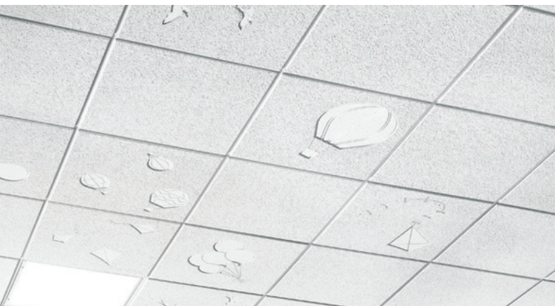
▲ Cirrus® Themes™ Things That Fly™ panels with Suprafine® XL® 9/16" suspension system