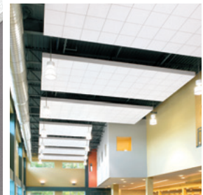
▲ Cirrus® Square Lay-in panels with Prelude® XL® 15/16" suspension system

See more photos at: armstrongceilings.com/photogallery