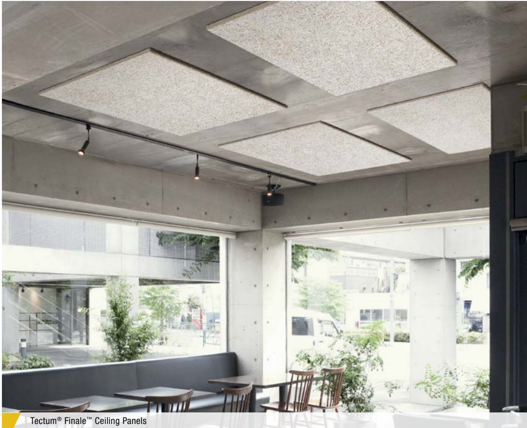
Tectum® Finale™ Ceiling Panels