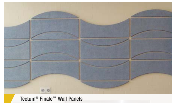
Tectum® Finale™ Wall Panels