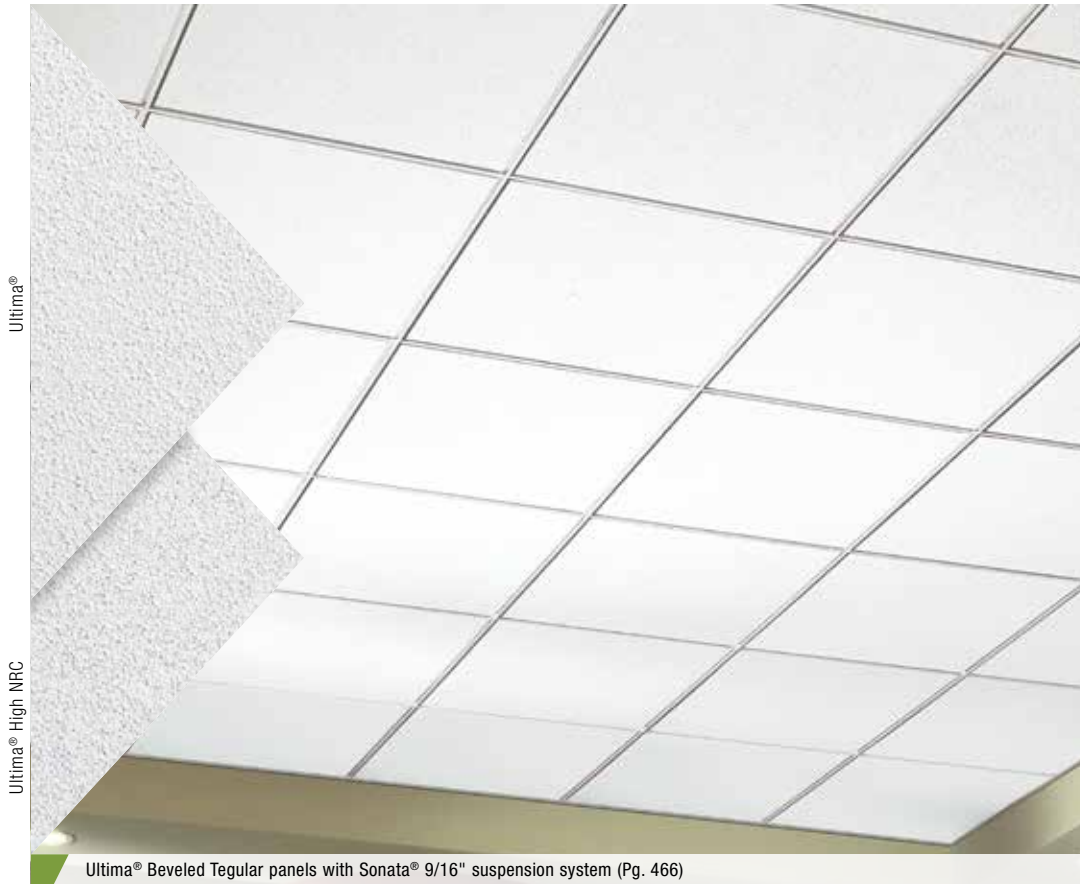
Ultima® Beveled Tegular panels with Sonata® 9/16" suspension system (Pg. 466)