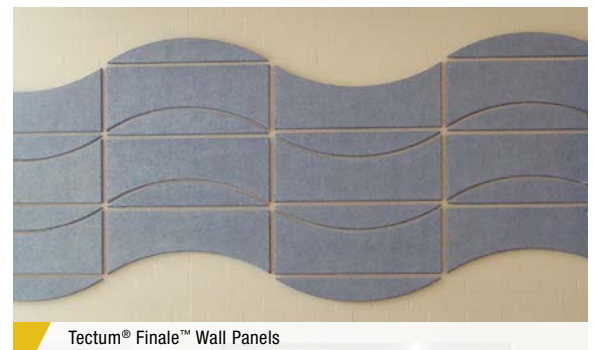
Tectum® Finale™ Wall Panels