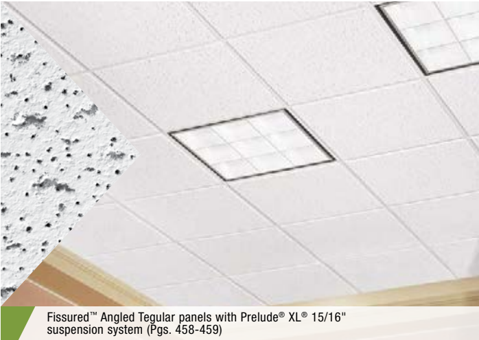
Fissured™ Angled Tegular panels with Prelude® XL® 15/16" suspension system (Pgs. 458-459)

This economical panel with a directional, fissured visual offers standard acoustics.