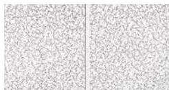
Cortega® Second Look® II panels – Scoring creates nominal 24" x 24" squares

COLORS Colored ceilings are dye-lotted and should be segregated by dye lot. Do not mix.