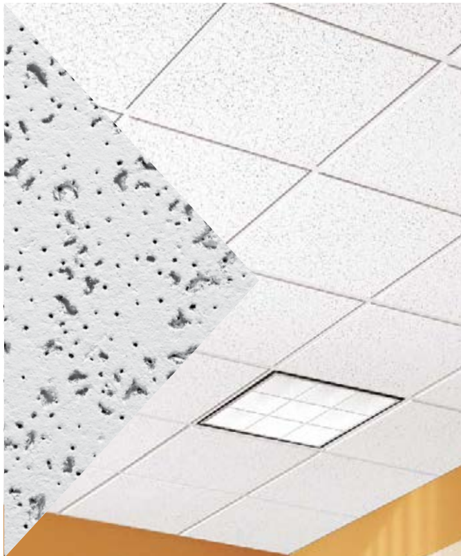
Cortega® Angled Tegular panels with Prelude® XL® 15/16" suspension system (Pgs. 458-459)