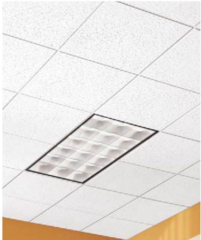
Cortega® Second Look® II panels with Suprafine® XL® 9/16" suspension system (Pgs. 466-467)

Cortega® panels offers a medium-textured, economical solution with standard acoustical absorption.