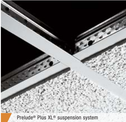
Prelude® Plus XL® suspension system

A 15/16" suspension system for severe environmental performance.