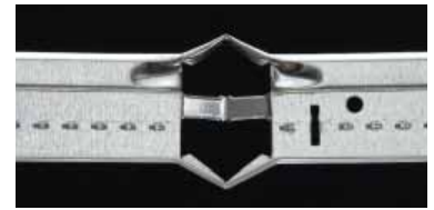
Main beam exposed to fire