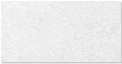
2012WH ACOUSTAFFIX® WHITE