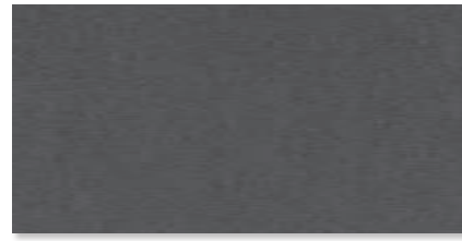
2012BL ACOUSTAFFIX® BLACK