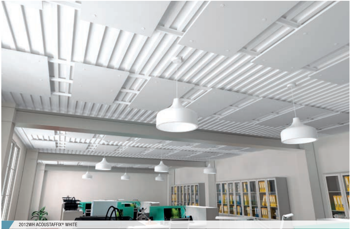
2012WH ACOUSTAFFIX® WHITE

AcoustAffix® fine-textured ceiling panels control acoustics while maintaining an open, exposed structure design. Panels are available in a field paintable 24-in x 48-in square style, and prefinished 24-in x 48-in square/reverse tegular styles.