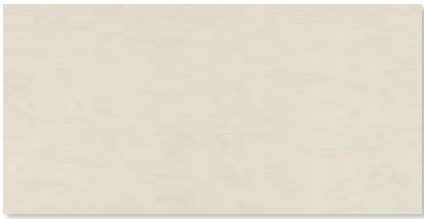
2012 ACOUSTAFFIX® FIELD PAINTABLE