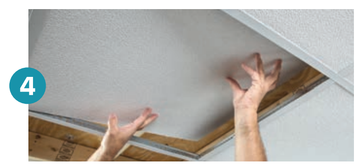
Install ceiling panels