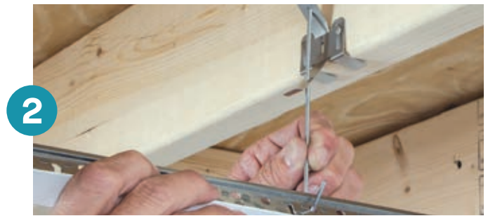
Suspend main beams with hanger wire or QuickHang™ hardware* (shown above: QuickHang hooks and brackets)