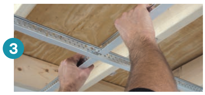
Install cross tees