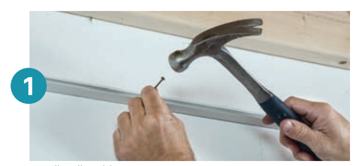
Install wall molding