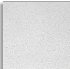
932 FINE FISSURED™