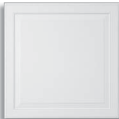
1205 SINGLE RAISED PANEL