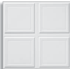
1201 RAISED PANEL™

Improved visual appeal over old traditional ceiling tiles