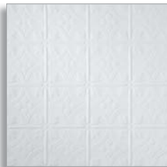
8008 TINCRAFT™ CIRCLES