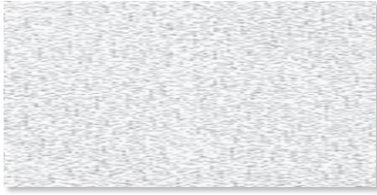
915 Textured FIRE GUARD™