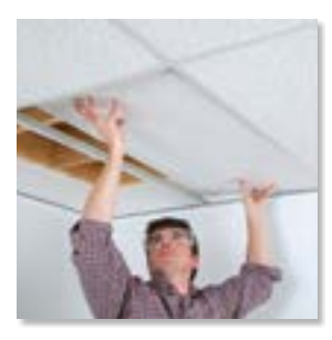
4 Install ceiling panels