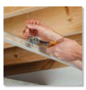
2 Suspend main beams with hanging hardware