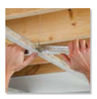
3 Install cross tees