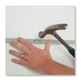
1 Install wall moldings