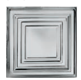
LARGE PANEL 24-in x 24-in SUSPENDED 5422505L 24-in x 48-in NAIL-UP (SURFACE MOUNT) 5424505N