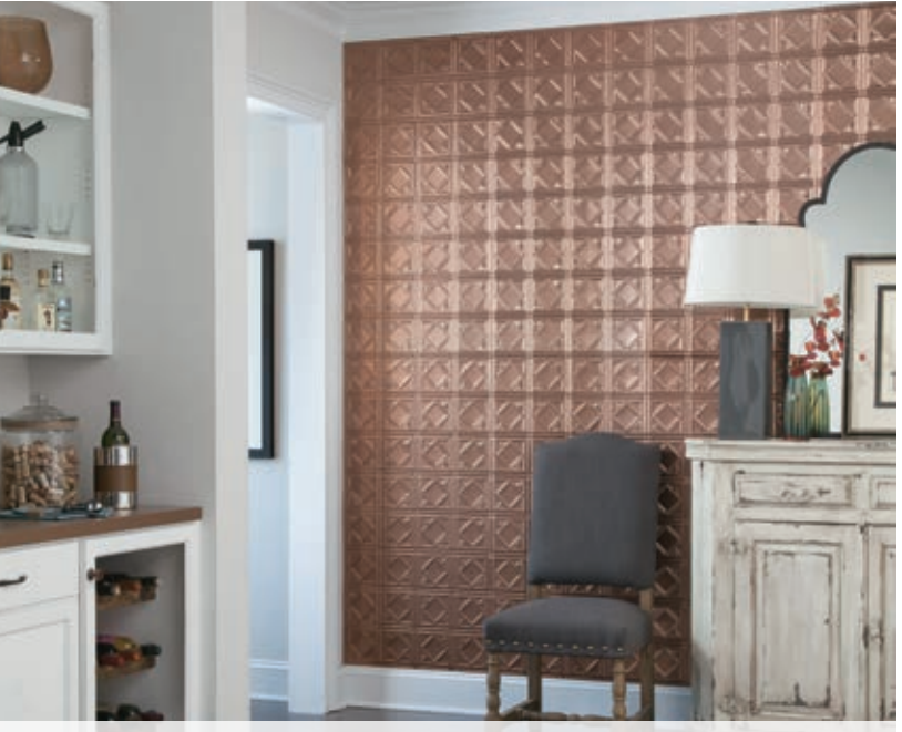
FANS 5424207NCP - COPPER (WALL)