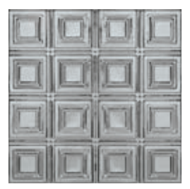
SMALL PANELS 24-in x 24-in SUSPENDED 5422204L 24-in x 48-in NAIL-UP (SURFACE MOUNT)

Whether building or renovating an existing space, an Armstrong® Metallaire™ ceiling will be the final detail that makes your room uniquely memorable. Make a bold and contemporary design statement, or create a quiet ambiance with subtle and sophisticated patterns. Panels are available as 24-in x 24-in suspended or 24-in x 48-in nail-up (surface mount) options.