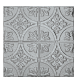
LARGE FLORAL CIRCLE 24-in x 24-in SUSPENDED 5422309L 24-in x 48-in NAIL-UP (SURFACE MOUNT) 5424309N