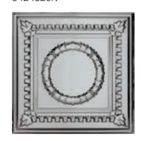
WREATH 24-in x 24-in SUSPENDED 5422503L 24-in x 48-in NAIL-UP (SURFACE MOUNT) 5424503N