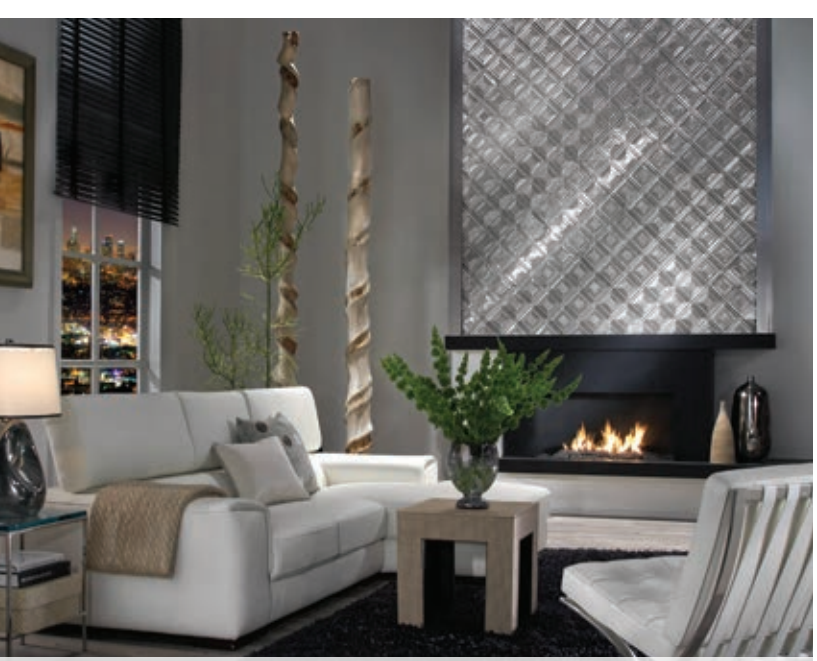
SMALL PANELS 5400204BNA - STAINLESS STEEL (WALL)