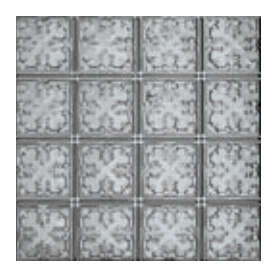
VINE 24-in x 24-in SUSPENDED 5422210L 24-in x 48-in NAIL-UP (SURFACE MOUNT) 5424210N