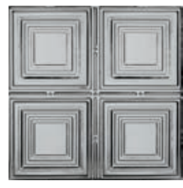
MEDIUM PANELS 24-in x 24-in SUSPENDED 5422320L 24-in x 48-in NAIL-UP (SURFACE MOUNT) 5424320N