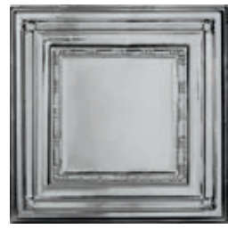
BEAD 24-in x 24-in SUSPENDED 5422504L 24-in x 48-in NAIL-UP (SURFACE MOUNT) 5424504N