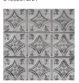
SMALL FLORAL CIRCLE 5400209BNA