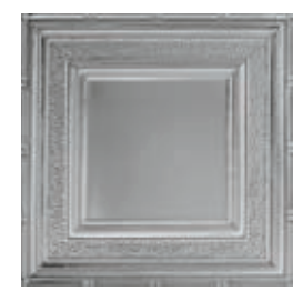
HAMMERED BORDER 24-in x 24-in SUSPENDED 5422509L 24-in x 48-in NAIL-UP (SURFACE MOUNT) 5424509N