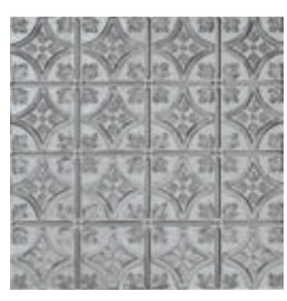
SMALL FLORAL CIRCLE 24-in x 24-in SUSPENDED 5422209L 24-in x 48-in NAIL-UP (SURFACE MOUNT) 5424209N