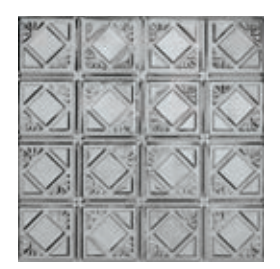
FANS 24-in x 24-in SUSPENDED 5422207L 24-in x 48-in NAIL-UP (SURFACE MOUNT) 5424207N