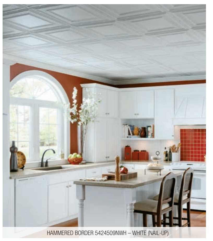
Capture turn-of-the-century ambiance with authentic reproductions of decorative metal ceilings.