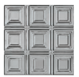
SMALL PANELS 5400204BNA

Metallaire surface mount panels can also be used as accent wall panels or possibly as a backsplash in certain applications. The larger, 24-in x 48-in panels are made of real metal and, while coated to protect from rust, it's important to avoid nicks, abrasive cleaners, and prolonged exposure to steam or water to maintain the product's appearance and performance.