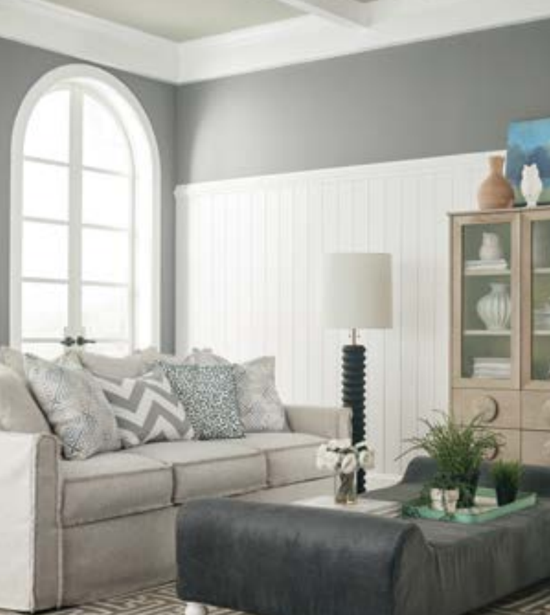
480 COUNTRY CLASSIC™ PLANK WHITE (CEILING)