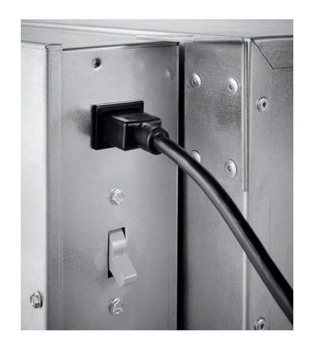
StrataClean IQ Power Plug

Above steps are manufacturer's suggested hanging techniques; always make sure to follow all local building codes, including seismic where applicable.