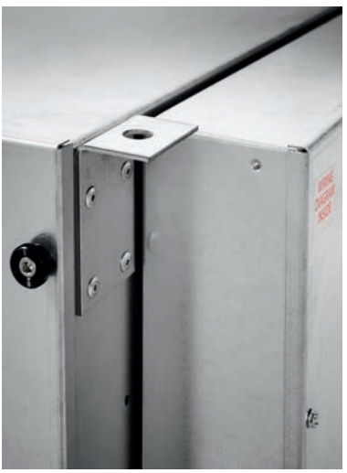
Hangers on Electrical Enclosure Side of Unit