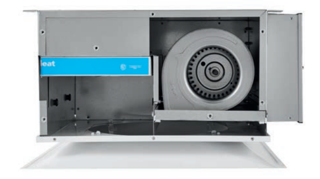
StrataClean IQ Access Panel Removed