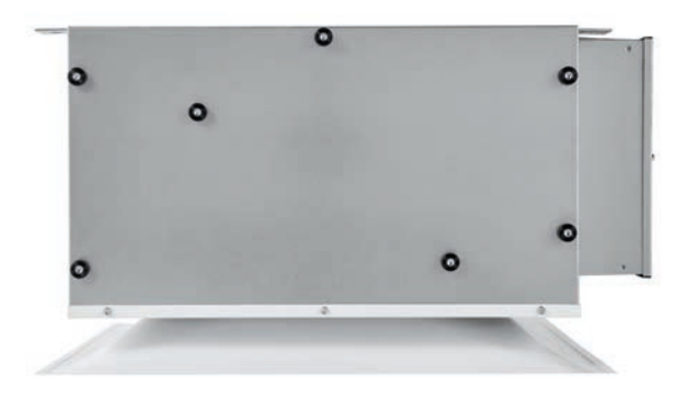
Shoulder Thumb Screws on (Fig 5) StrataClean IQ Access Panel

For example: Running 8 hours per day = 500 days, running 12 hours per day = 333 days.