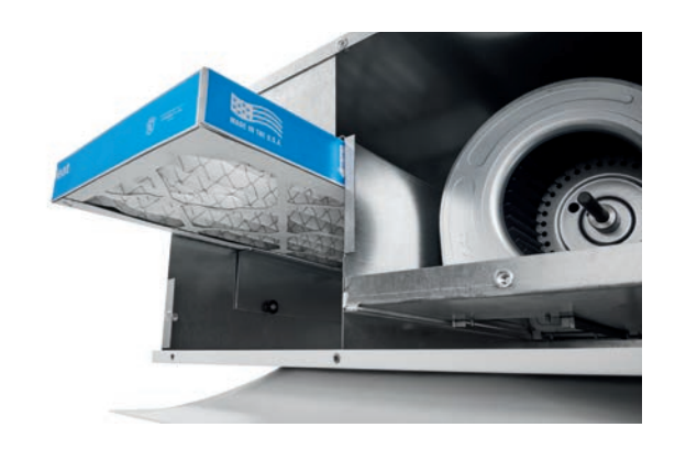
StrataClean IQ Filter Change