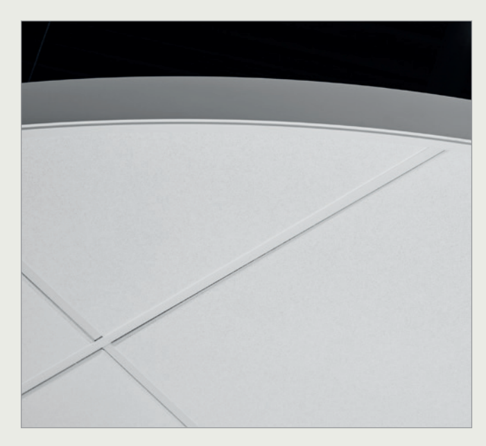
Factory-precision mitering in custom lengths – both straight and curved – allows for smooth, clean finishes.

To help ensure feasibility of the architect's design intent and add construction efficiency, ProjectWorks® provided detailed drawings for the project's 4,000 linear feet of Axiom® based on realistic manufacturing capabilities. Further, since the Axiom was prefabricated, ProjectWorks helped optimize the layout's splice locations and the manufacturing trim schedule to yield the least amount of scrap possible. The pre-cut Axiom was shipped to the jobsite, generating no additional waste during construction, resulting in a sustainable enhanced visual.