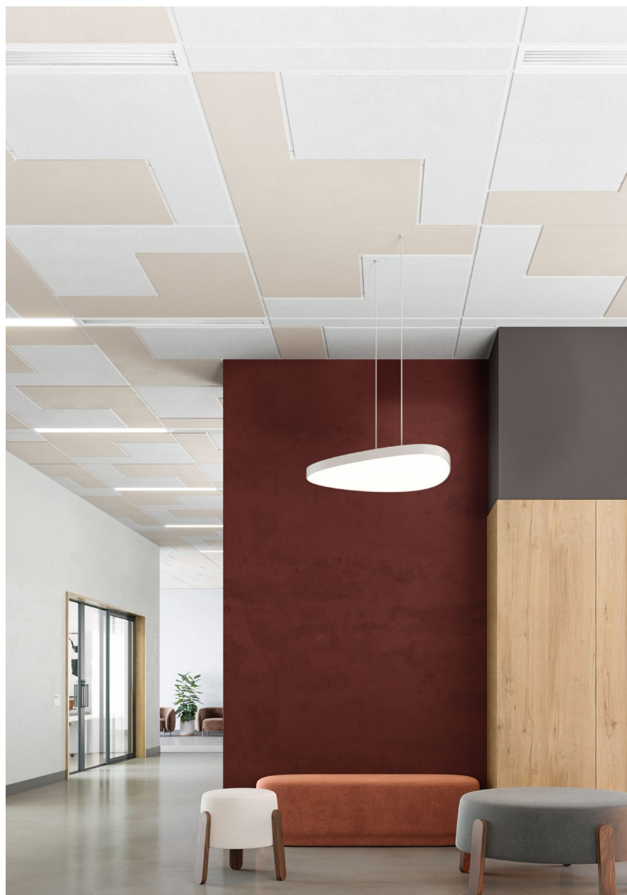
DesignStackz™ Ceiling Panels with Suprafine® XL® Suspension System