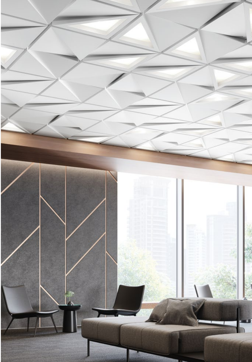
CastWorks™ Metaphors® ceiling panels in Tectonic design with integrated lighting from Omnify