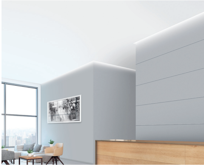
Wall Reveal Moldings

Wall Reveals create a horizontal or vertical separation in drywall walls, allowing for easy transitions from drywall to drywall panels or drywall to AcoustiBuilt® panels for wall applications.