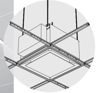
StrataClean IQ™ Air Filtration System with Ultima® Health Zone™ ceiling panels installed on 9/16" Suprafine® XL® suspension system

The quiet Armstrong StrataClean IQ™ Air Filtration System captures airborne contaminants, allergens, and particulates to create cleaner, healthier, indoor air quality for every space using proven MERV 13 filtration†.