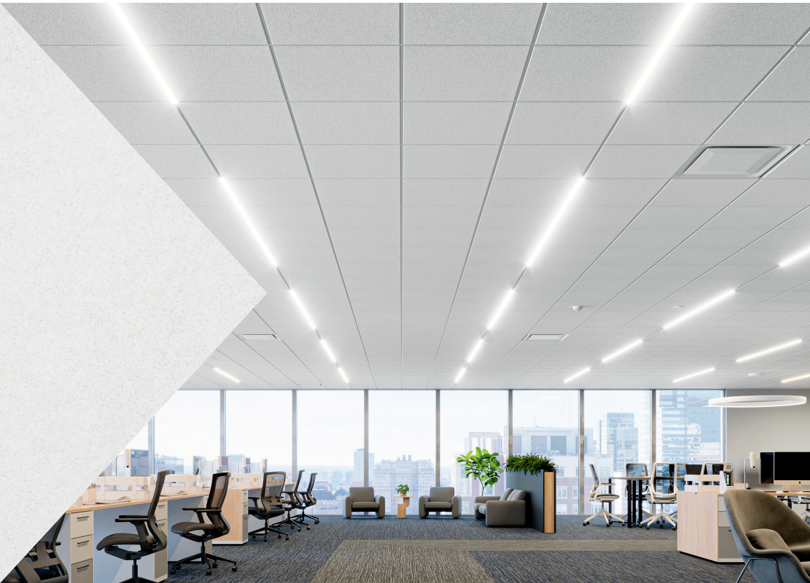
Pueblo Beveled Tegular panels with Suprafine® XL® 9/16" suspension system

CAD/Revit® drawings at: armstrongceilings.com/cadrevit