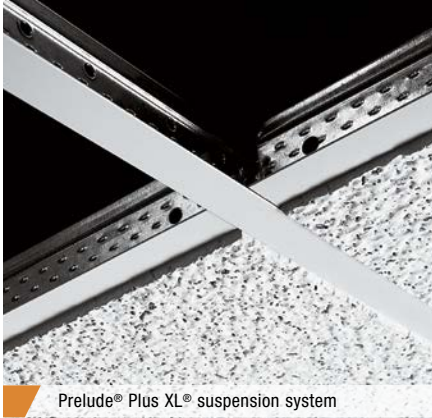
Prelude® Plus XL® suspension system

A 15/16" suspension system for severe environmental performance.