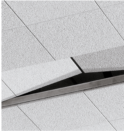
Prelude® Concealed suspension system

SUSTAIN™ High Performance Sustainable Ceiling Systems