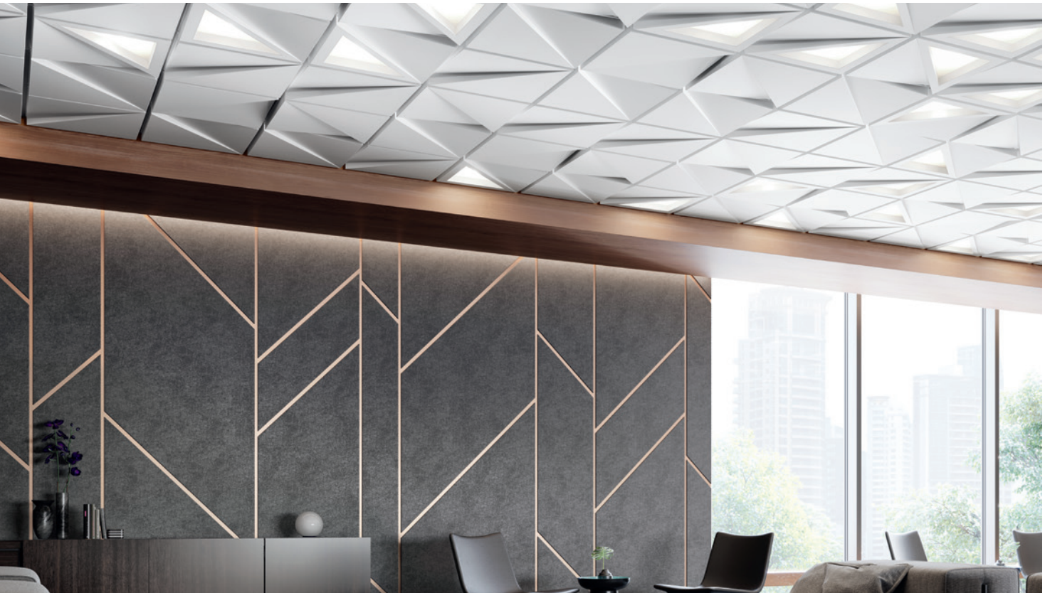
▲ Plasterform Metaphors ceiling panels in Tectonic design with integrated lighting from Backlight

Ceiling Panels GRG – Glass Fiber Reinforced Gypsum