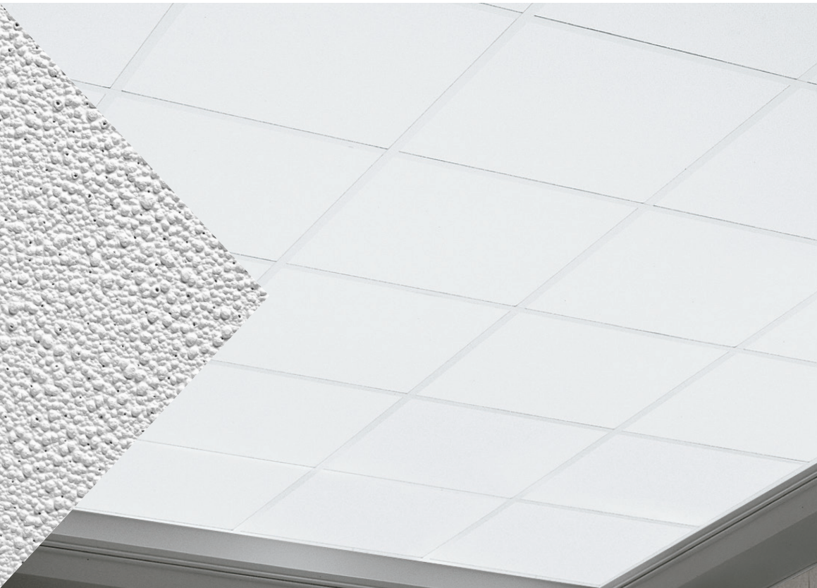
▲ Pebble™ panel with Prelude® XL® 15/16" suspension system

CAD/Revit® drawings at: armstrongceilings.com/cadrevit