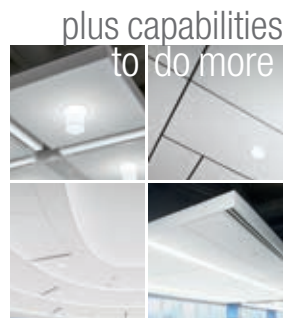
▲ Optima® Tegular 24" x 24" panels with Suprafine® 9/16" suspension system

armstrongceilings.com/capabilities See more photos at: armstrongceilings.com/photogallery