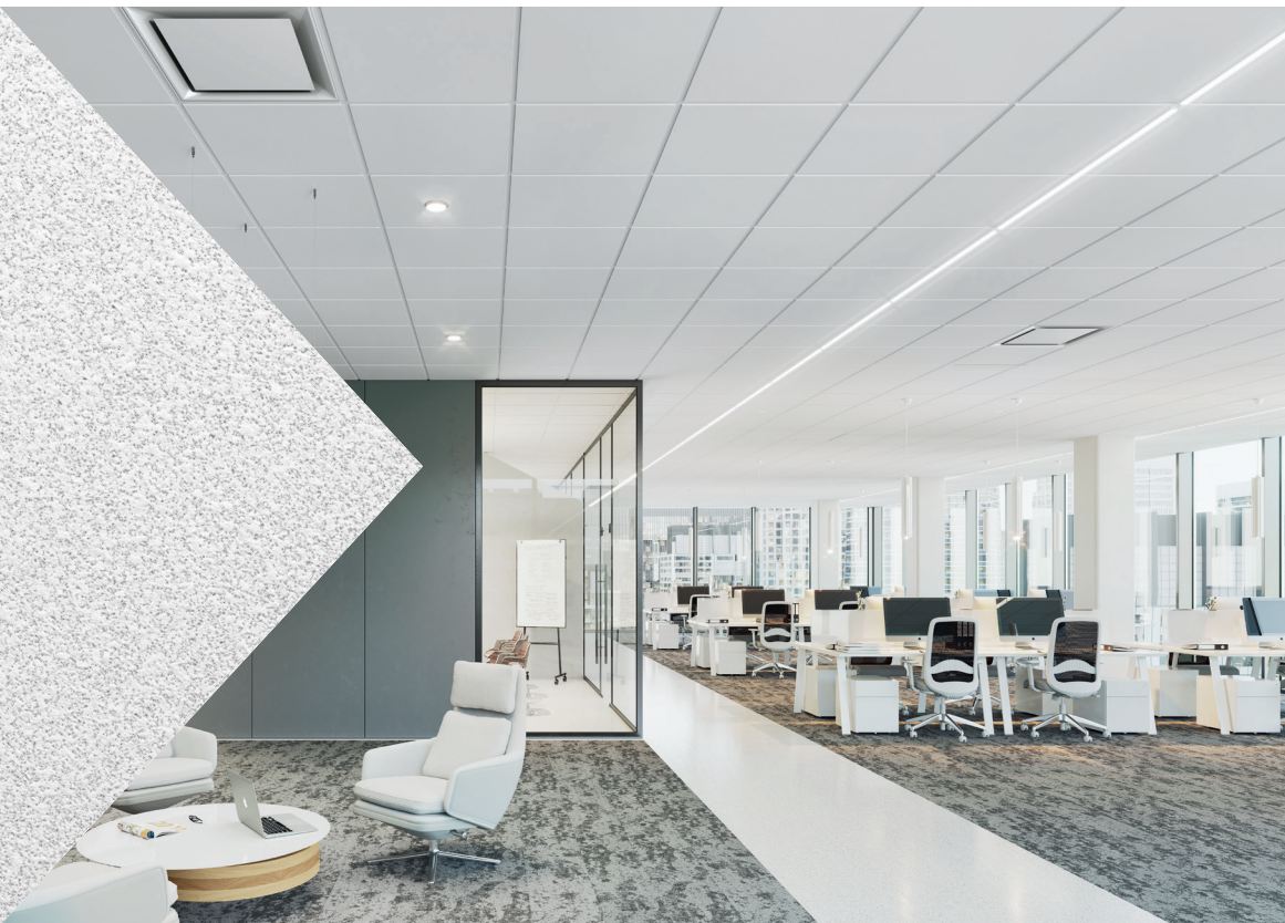
Optima Health Zone Square Tegular panels with Prelude XL 15/16" suspension system

CAD/Revit® drawings at: armstrongceilings.com/cadrevit