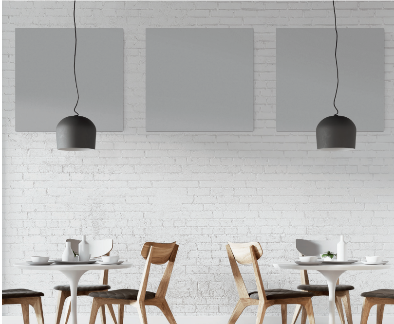
Lyra® PB Direct-Apply wall panels

Lyra® PB Direct-Apply wall panels provide sustainable and acoustical options for a wide variety of applications and install directly to wall surfaces using ceiling adhesive.