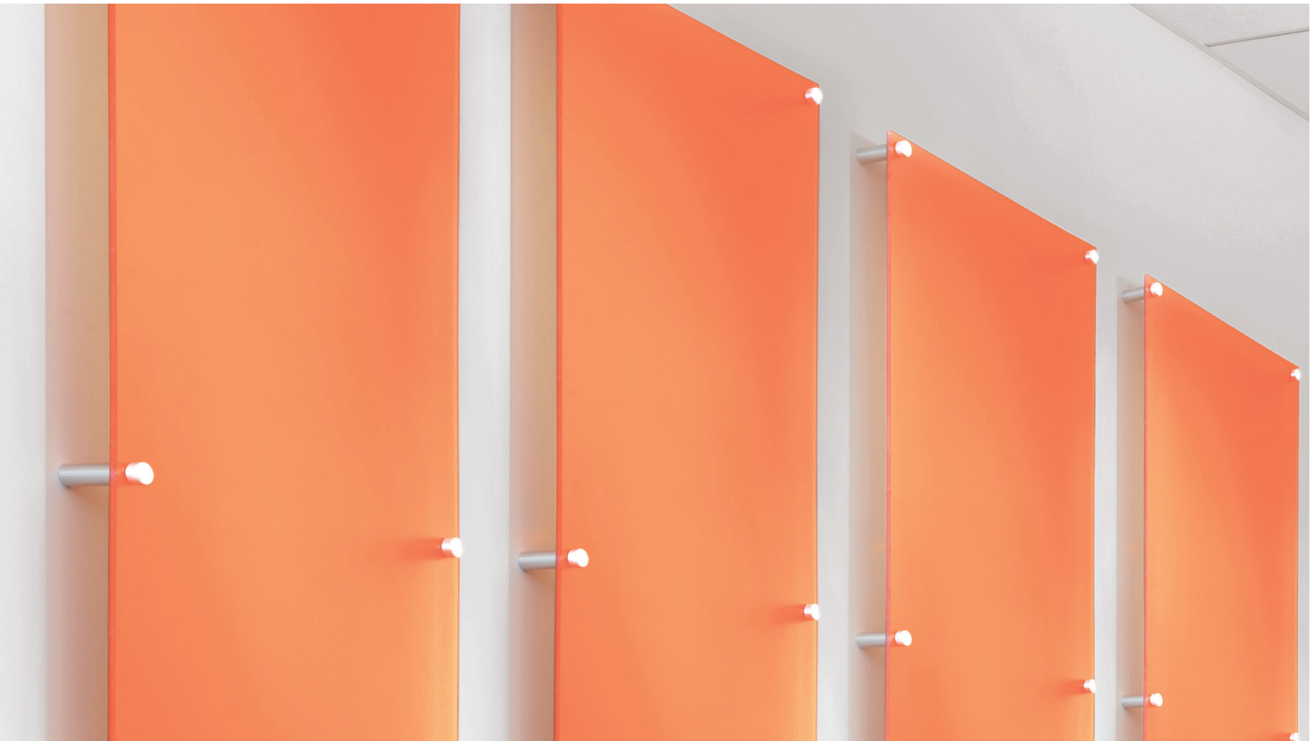
Infusions™ Walls 24" × 96" in Refined Tangerine

Wall System available in translucent colors and patterns that can be hung individually or in a group.