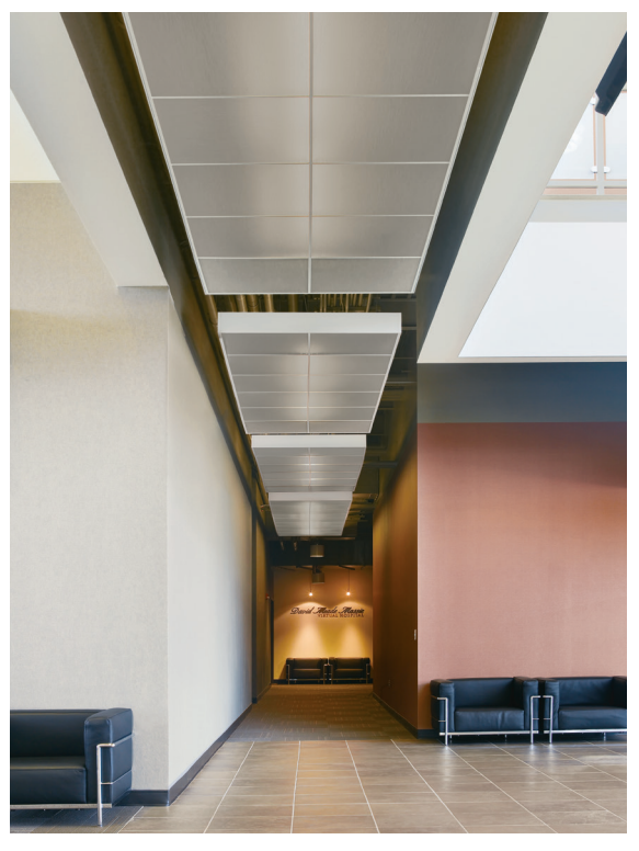
Infusions Lay-in in Natural Linen