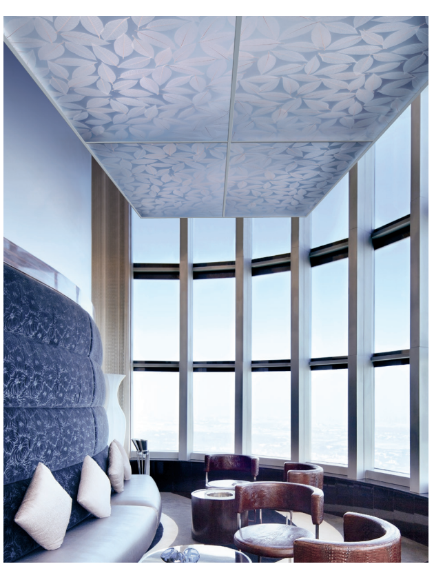
Infusions 24" × 48" Lay-in Panels in Blue Arbor

Infusions® 24" × 48" lay-in panels in Caribbean Renewal