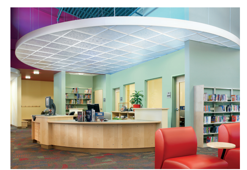
Infusions® Lay-in in Clear Arbor

* Due to the unique nature of the woven fabric used in these products, color may vary from panel to panel.