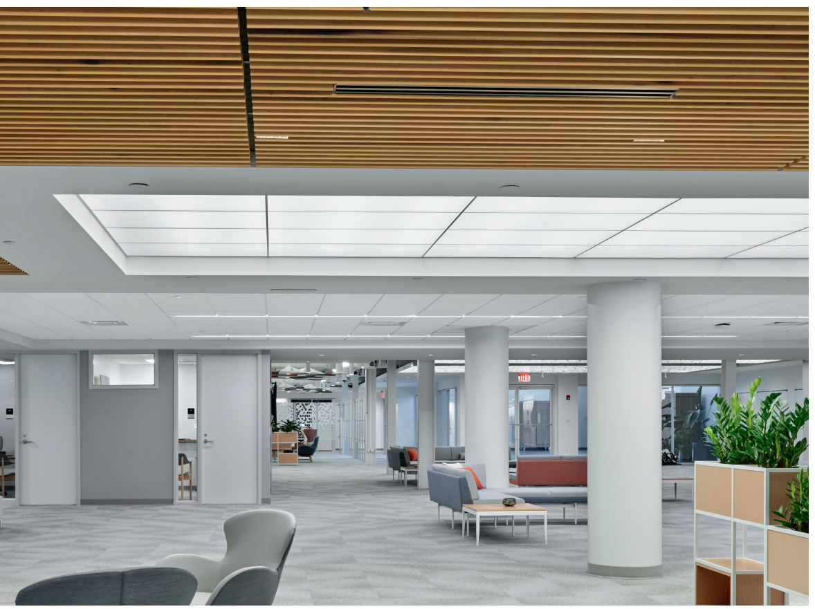
Infusions 24" × 48" Lay-in Panels in Calm Water