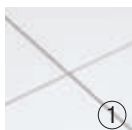
1. Lyra® PB Vector® with Prelude® XL® 15/16" suspension system

TechLine 877 276-7876 armstrongceilings.com/lyra