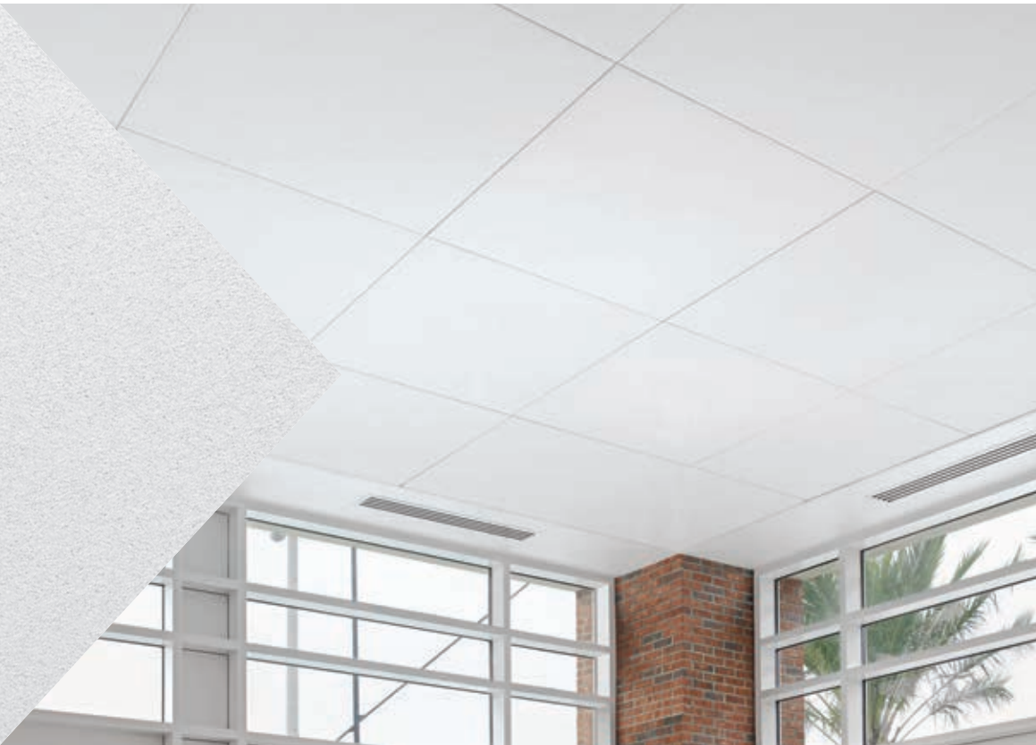
▲ Lyra® PB Vector® panels with Prelude® XL® 15/16" suspension system

armstrongceilings.com/capabilities See more photos at: armstrongceilings.com/photogallery