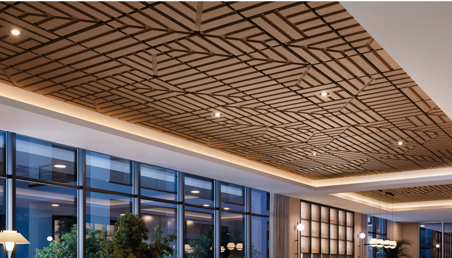
CastWorks Metaphors Parquet design ceiling panels in Walnut

Precast 24" × 24" Glass-Fiber Reinforced Gypsum (GRG) panels are now available in additional designs and wood-look finishes as a quoted option.