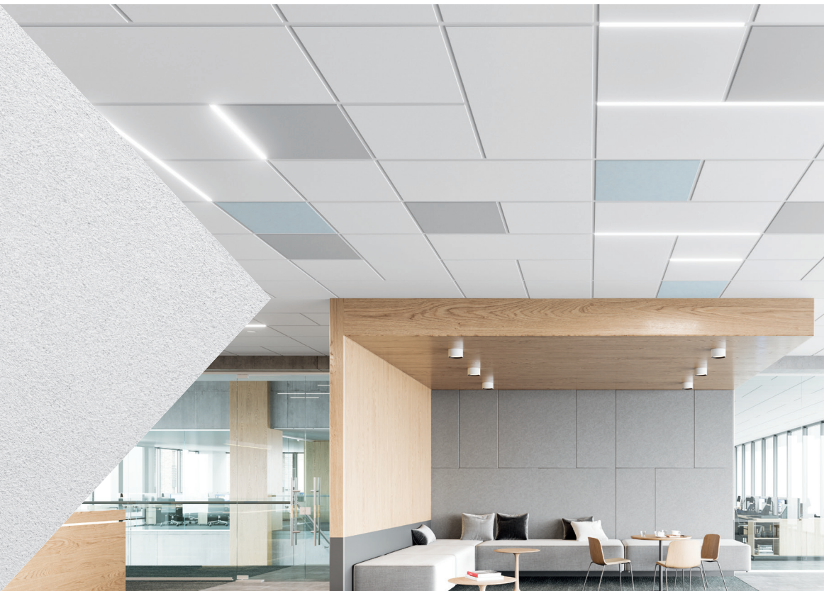
▲ Calla Health Zone Square Tegular panels with Suprafine® 9/16" suspension system

CAD/Revit® drawings at: armstrongceilings.com/cadrevit