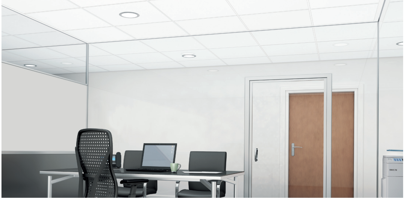
Axiom® Glazing Channel trim for glass partitions

Axiom® Glazing Channel extruded aluminum trim for 3/8" and 1/2" glass partition walls offers fully concealed integration with all Armstrong acoustical and drywall ceiling systems. Glass disappears into the plenum* to create a clean, installed visual.